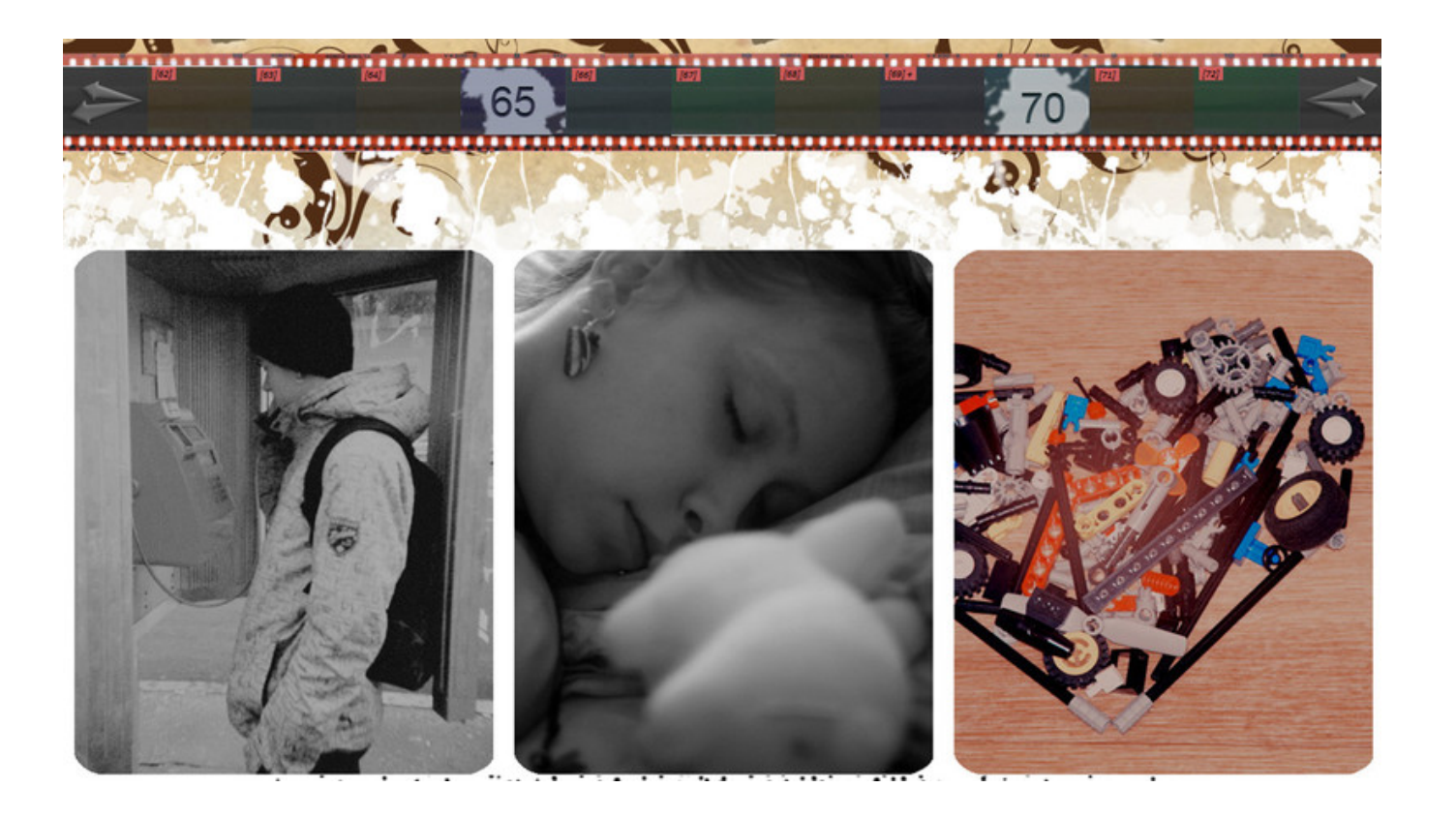
Download ->->-> http://bit.ly/2NI94LW

Travel Riddles: Trip To Italy Crack All Type Hacks